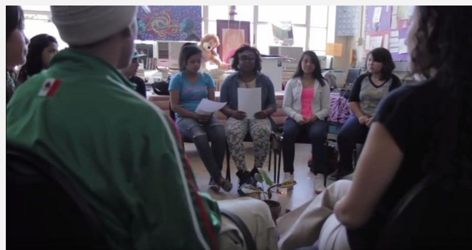
Students and teachers participate in a Restorative Justice Circle in OUSD.

"CHILDREN HAVE NEVER BEEN VERY GOOD AT LISTENING TO THEIR ELDERS, BUT THEY HAVE NEVER FAILED TO IMITATE THEM." JAMES A. BALDWIN